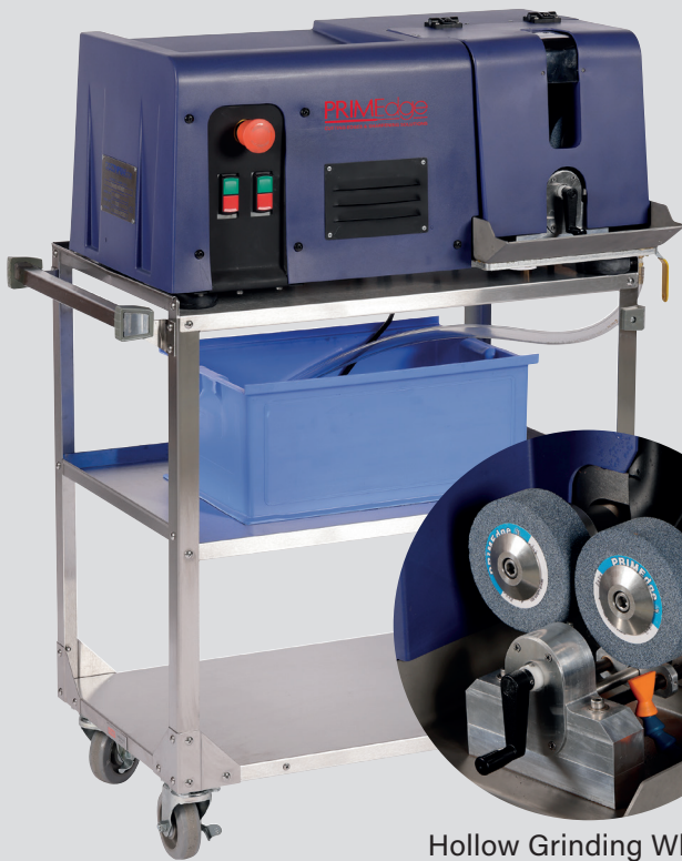
Hollow Grinding Wheels