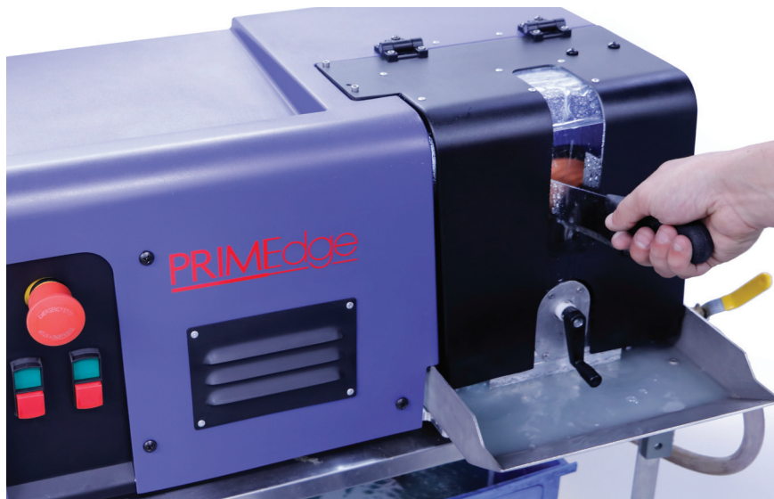
Twins™ Knife Sharpening System